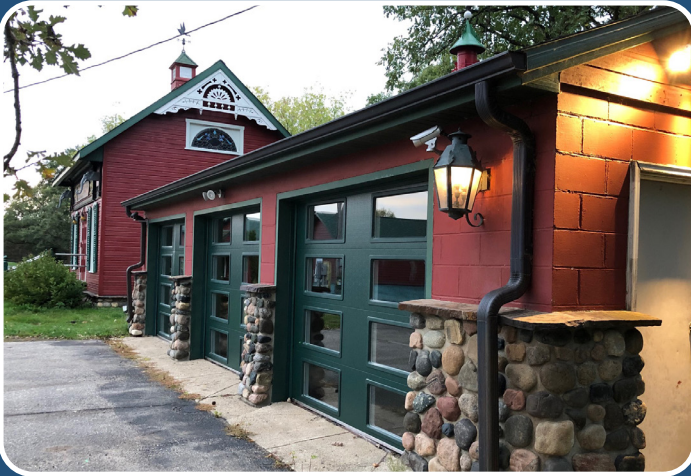
Home for arts and crafts, with staff housing beyond.

Registrations must be paid in full by December 1 to receive discount.