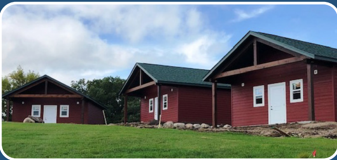
Three of the new cabins that surround the Village Green.