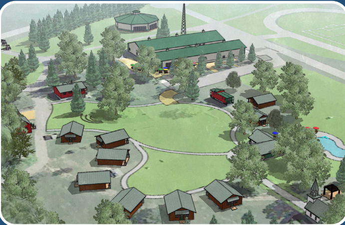
Artist's rendering of the main camp area.