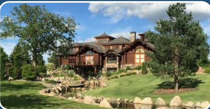
Twin Oaks Lodge with its beautifully landscaped backyard and lawn.