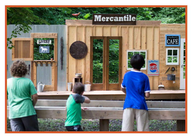
Thanks to a Thrivent Action Team and a group of dedicated volunteers, our sling shot range received major updates just in time for summer!

THIS YEAR AT CAMP EVERYTHING CLICKED. THE CLICK OPENED MY HEART AND SOUL TO GOD. THE JOY I EXPERIENCED HERE IS INDESCRIBABLE. THE TEACHING IS IMMENSE AND I NOW KNOW THAT THE CROSS HAS THE FINAL WORD."